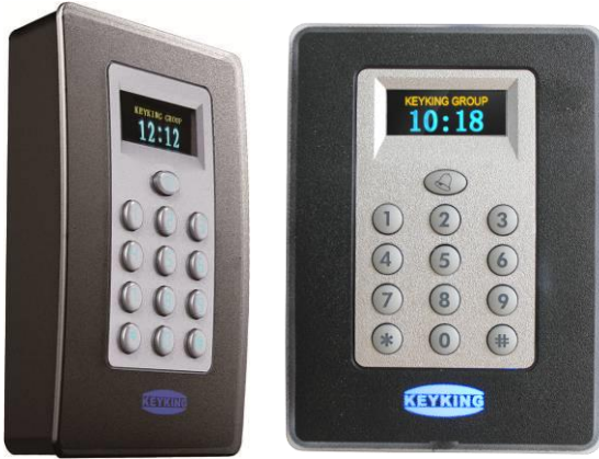
TA7003NT (Reader Option Built-in) (E: Proximity; M: Mifare; H: HID)